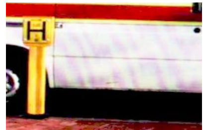
Flag Post Marker Paint, water-based protection for indicator posts

*The theoretical spreading rates have been calculated for the stated volume solids and dry film thickness. A practical spreading rate will depend on the actual dry film thickness, the nature of the substrate, and the relevant consumption factor. The physical constants are subject to normal manufacturing tolerances.