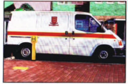
Special purpose products formulated for Essex Fire and Water

Theoretical spreading rate: 12 sq.metres per litre