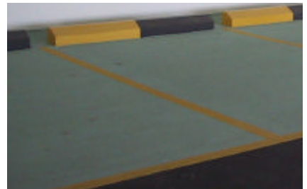
Special colours available on request

Theoretical spreading rate: 15 sq. metres per litre